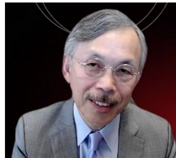
Jiang He, MD, PhD, FAHA

Control Project selected 326 villages across three provinces in rural China. Half the villages, 163, were randomly assigned to receive care by intervention village doctors, and 163 assigned to usual care. The program enrolled 33,995 individuals 40 years and older, with uncontrolled hypertension, defined as untreated BP at below 140/90, treated BP at or below 130/80 or untreated BP at or under 130/80 with a history of clinical cardiovascular disease.