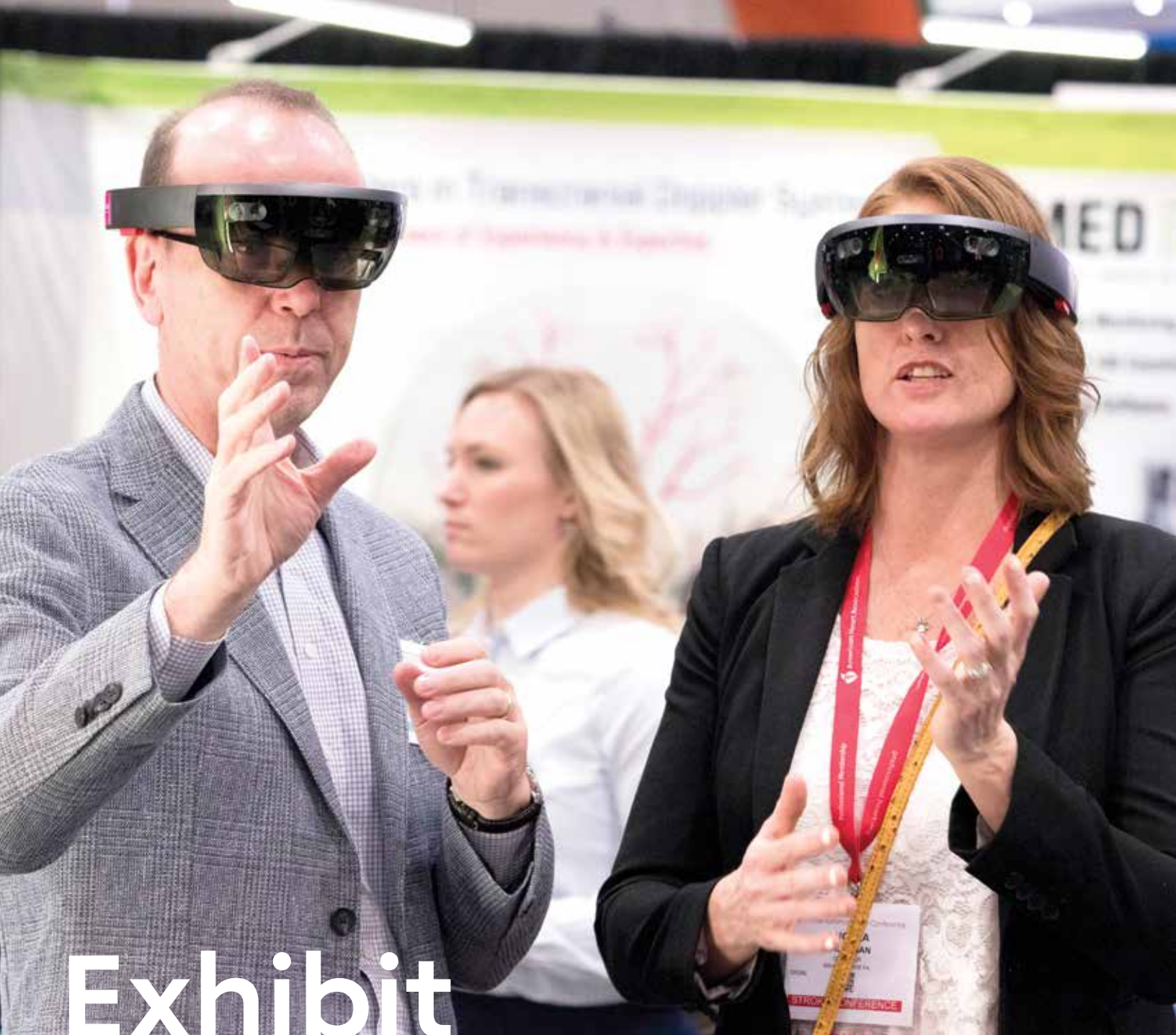
Exhibit Prospectus 2021

Cultivate your audience with this growing conference of 4,600+ of the world's most influential stroke and cerebrovascular experts.