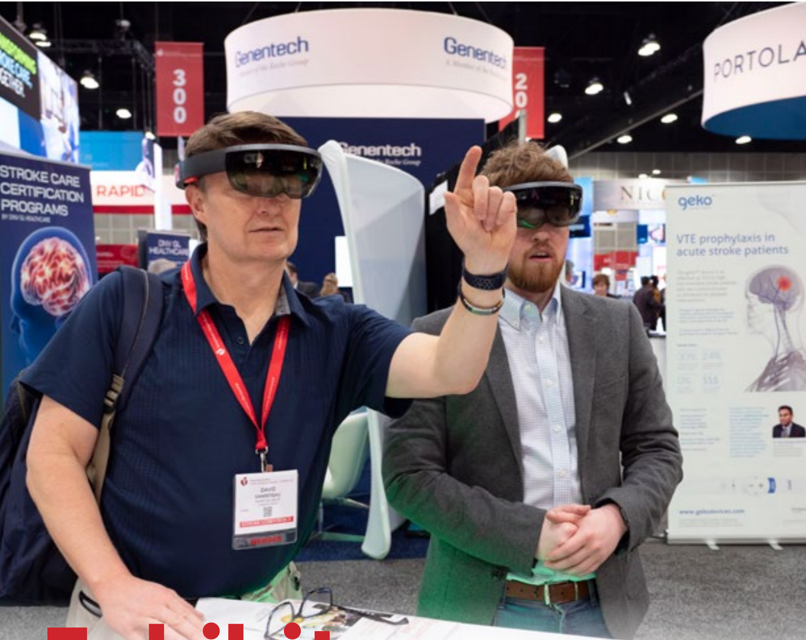
Exhibit Prospectus 2022

Explore opportunities for both on-site and virtual exhibiting