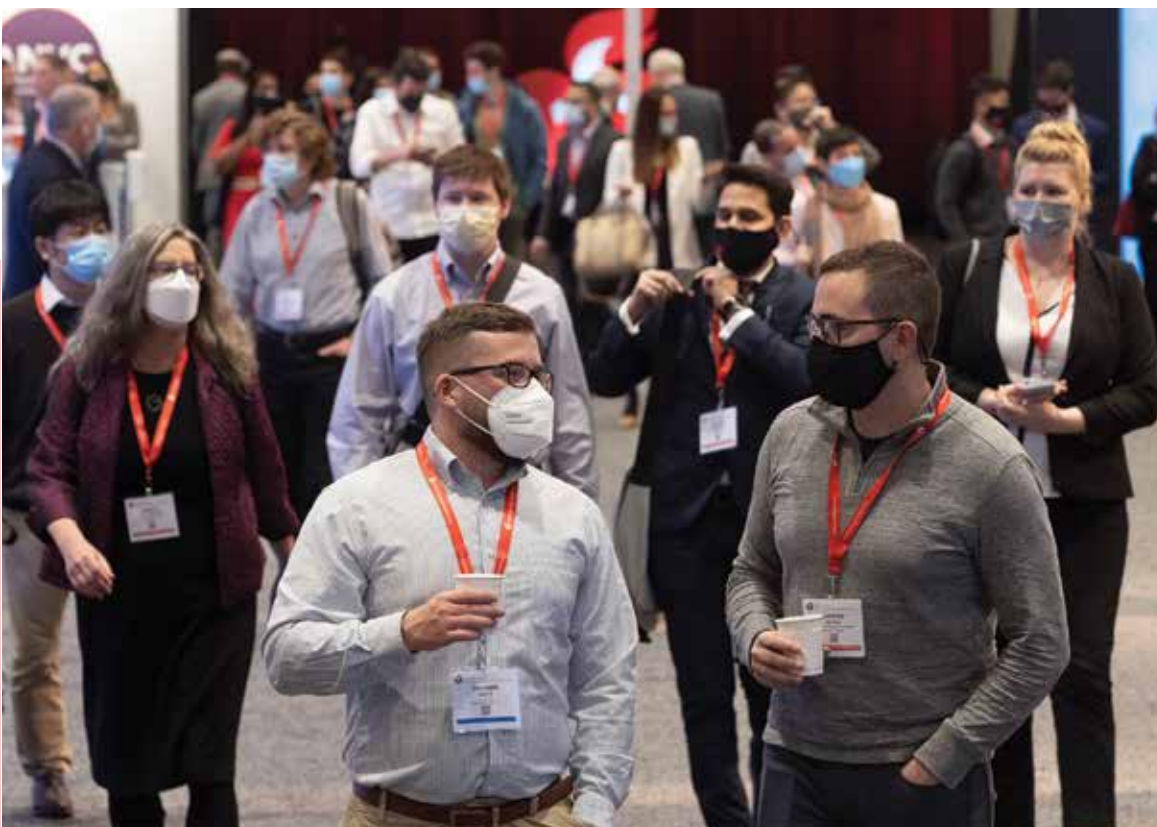
Exhibit at #ISC23

February 8–10, 2023 | Dallas, TX + Virtual Kay Bailey Hutchison Convention Center