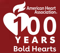
Exhibit at #ISC24!

February 7-9, 2024 | Phoenix, AZ Phoenix Convention Center